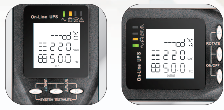
Two directions LCD display