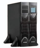
Battery Cabinets (Optional)